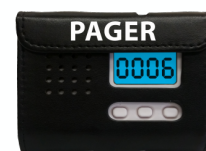
433-PGD Pager (optional extra)